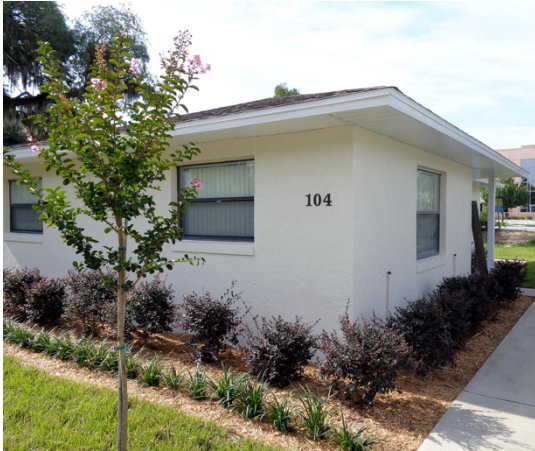
Mid Florida Homeless Coalition's Office in Inverness

The Mid Florida Homeless Coalition is the lead agency for the State of Florida and the Federal Department of Housing and Urban Development (FL520-Citrus, Hernando, Lake and Sumter). The Coalition is the lead agency coordinating Citrus, Hernando, Lake and Sumter's response to homelessness, and as such serves as the primary support organization for the community's Continuum of Care (CoC). The CoC system creates an improved homeless service system that more effectively provides services, support and housing to all sub-populations within Citrus, Hernando, Lake and Sumter's homeless community, with a primary focus on moving individuals and families out of homelessness. The ultimate goal of the CoC is the creation of a homeless service system that achieves reduction in new instances of, length of, and returns to homelessness and meets the varying needs of homeless sub-populations such as unaccompanied youth, veterans and families with children. PHP is a member of the Mid Florida Homeless Coalition